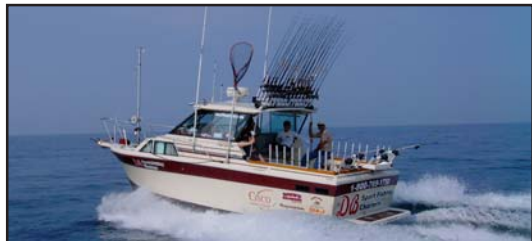
DB III (30 Ft) Capt. Rick Hildebrand

You will be fishing aboard one of our Baha hardtops. Each boat offers a safe, dry and comfortable ride. They are fully insured and equipped with the latest in fishing, safety and navigation equipment.